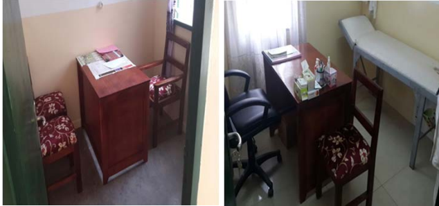
FP Counseling and Method Provision Rooms after Renovation