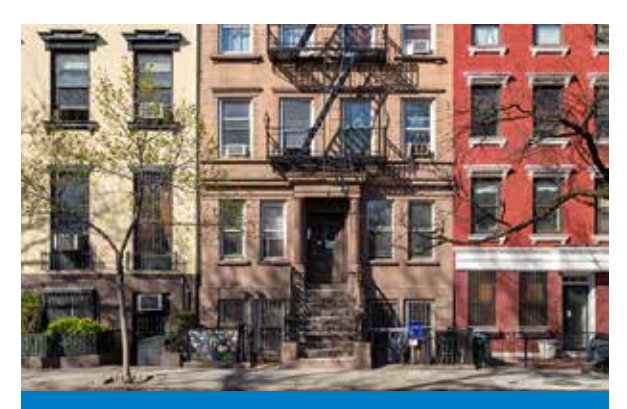
FAIR HOUSING ACT OF 1968

For example, asthma mortality rates in African American<sup>i</sup> children are nearly eight times higher than in non-Hispanic White children.<sup>1</sup> When observing trends among the negative health consequences linked to housing, it is evident that health equity — and not just health — is a key consideration.