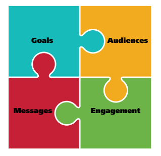
Figure 1: Four steps of the GAME Plan Framework.

To develop a communications strategy, Resonance uses a GAME plan framework that guides you through the four key steps involved in strategic communications planning, which will ensure you reach your organizational or campaign goals and reach your target audiences.