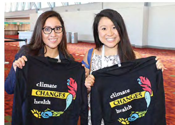
APHA members display their Annual Meeting T-shirts at the climate change-themed 2017 meeting in Atlanta.

In addition to standing up for science, APHA also took to the streets. For the second year in a