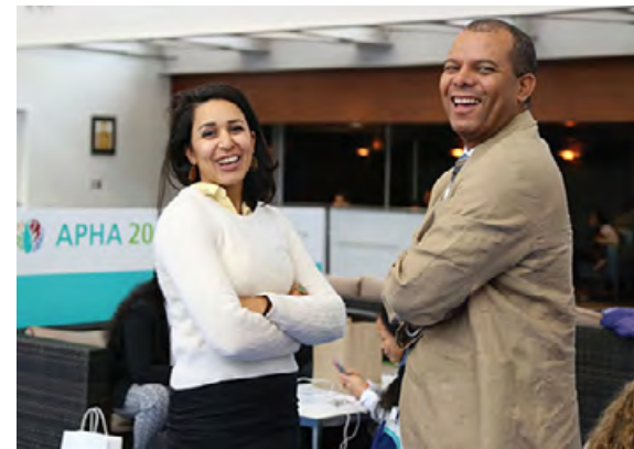
Annual Meeting attendees network during APHA 2017 in Atlanta.

Last May, as part of its efforts to support active living, the APHA center teamed up with the Institute of Transportation Engineers and the League of American Bicyclists to launch a new website based on data from the “Bicycling and Walking in the United States: 2016 Benchmarking Report.” APHA staff published a