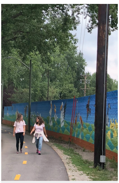
Newberry trail in Appleton

"The Transportation and Health Tool workshop was the starting point for an ongoing discussion of the applicability