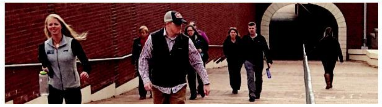
A recently constructed pedestrian tunnel offers students and Greensboro residents a safe and direct passage through campus while averting train tracks overhead.

THE UNIVERSITY OF NORTH CAROLINA — GREENSBORO (UNCG) has worked in close partnership with the city to promote transportation and health. Together they have established a new foundation for a number of bicycle/pedestrian and public transit initiatives that have made travel around UNCG and other parts of the city safer and more conducive to healthy lifestyles.