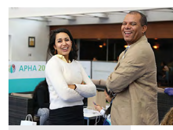
Annual Meeting attendees network during APHA 2017 in Atlanta.

Last May, as part of its efforts to support active living, the APHA center teamed up with the Institute of Transportation Engineers and the League of American Bicyclists to launch a new website based on data from the "Bicycling and Walking in the United States: 2016 Benchmarking Report." APHA staff published a